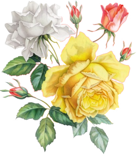
2ND — 5TH JUNE THEMANCHESTERFLOWERSHOW.COM