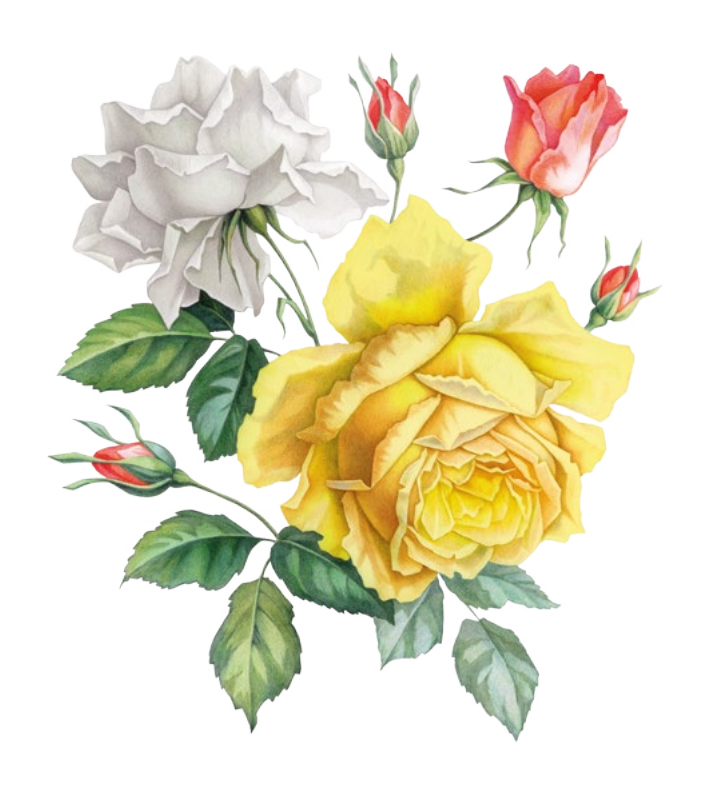
2ND — 5TH JUNE THEMANCHESTERFLOWERSHOW.COM #MCRFLOWERSHOW